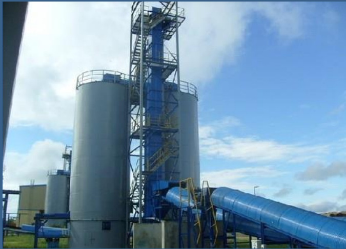
SATAREM Bucket elevator